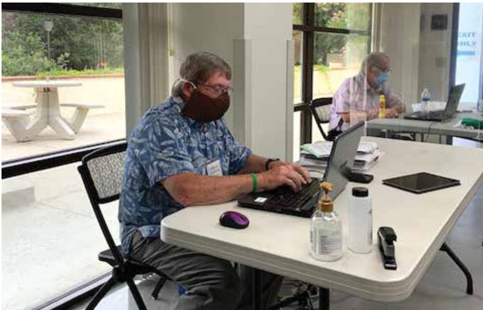
CSVP Volunteer Tax Preparers prepared close to 2,000 free income tax returns

P.O. Box 1286, 91358 Thousand Oaks, CA 235 N. Moorpark Road Thousand Oaks, CA 91360 805-379-3538 shelterhopepetshop.org