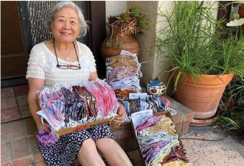
CSVP volunteers have made over 4,000 masks for local nonprofit and public service organizations