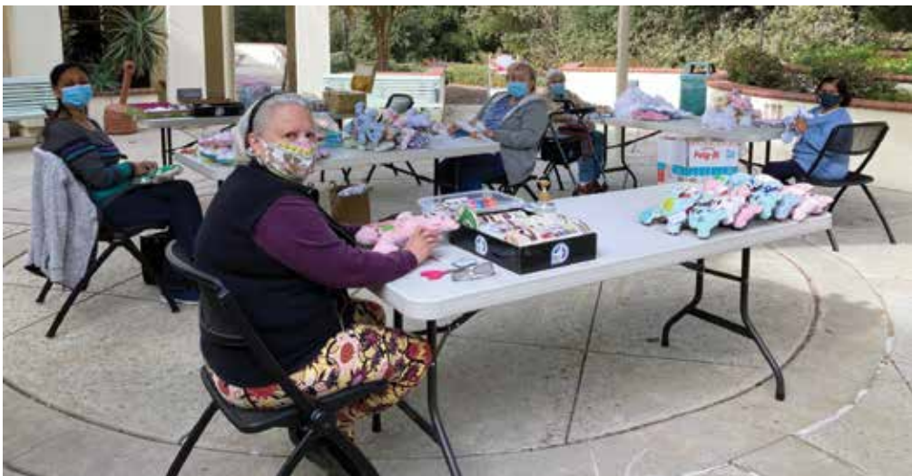
CSVP Teddy Bear Group make bears for local partner agencies, including the Autism Society and Title 1 Schools in the Conejo Valley

Primary & Specialty Care 1250 La Venta Drive, Ste. 101A Westlake Village, CA 91361 818-262-3556 uclahealth.org/westlake-village