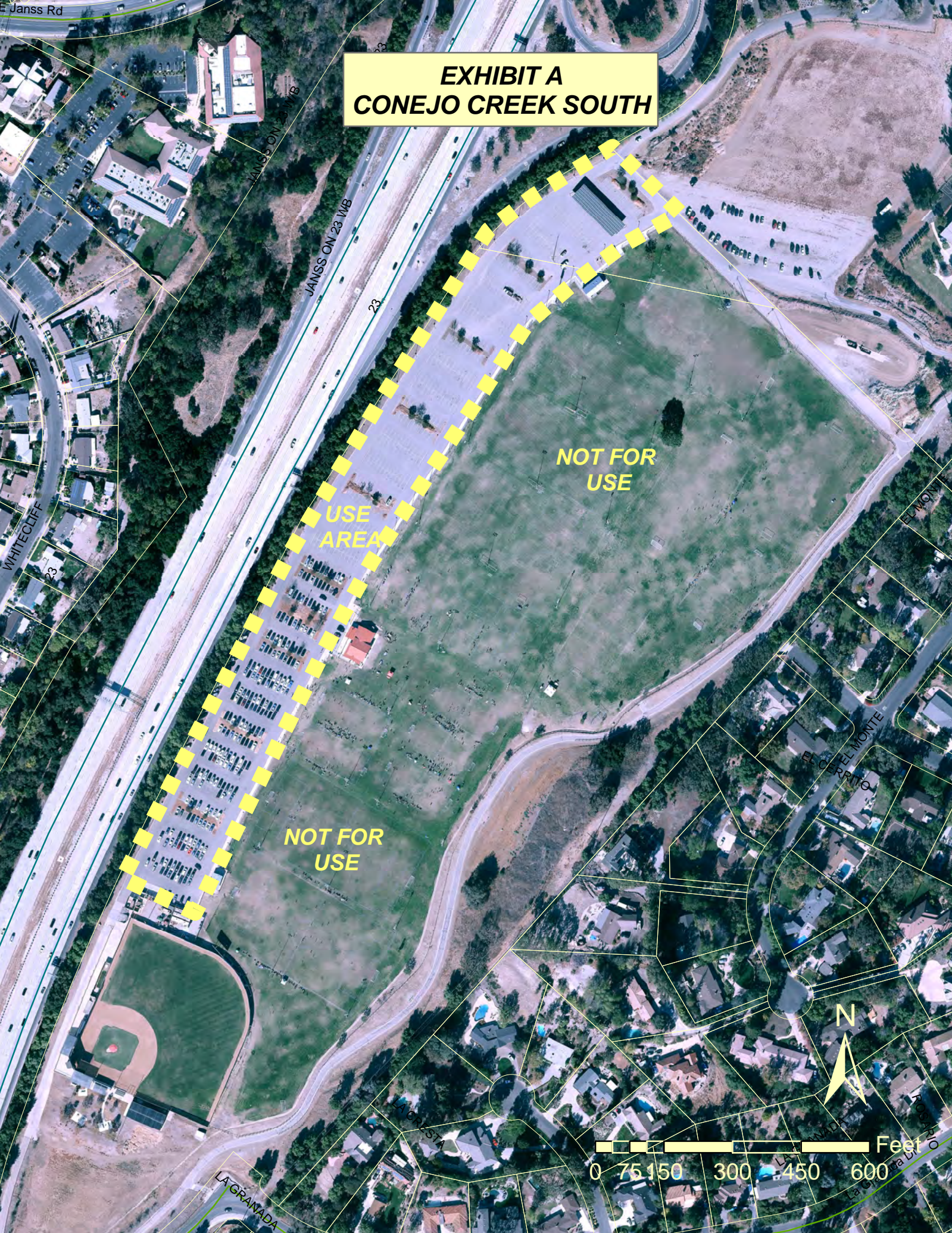
EXHIBIT A CONEJO CREEK SOUTH